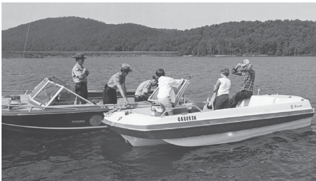
In 1960, the year of NASBLA's founding, the number of boats in the U.S. was 2.4 million. By 2009 the number increased to 12.7 million.

boating safety officers whose outstanding achievements are chronicled on the preceding pages. We are reminded by an article from a century ago that we will meet resistance from the boating community even when our goal is noble: making boating safe and enjoyable for all who take to our waterways.