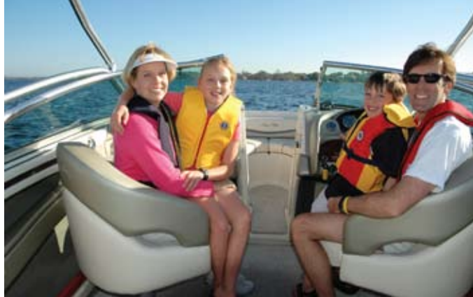
Research shows that among boat buyers who attend a boat show, 70 percent purchase their new boat within three months of attending the show.

especially in the areas of youth sailing, training and safety. He received the award during US SAILING's annual meeting in October.