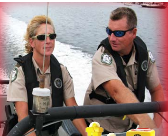
See-Me™ H2O-Activated LED Lights and Strobes