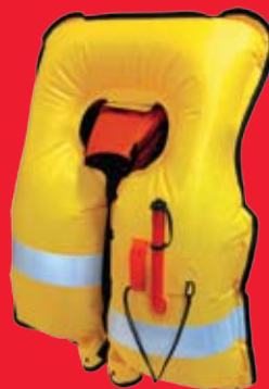
ComfortMax™ Inflatable PFDs

With Revere, Our Officers Can Survive ANYTHING.