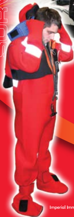
Imperial Immersion Suits