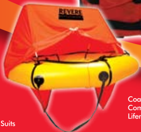
Coastal Compact™ Lifterafts